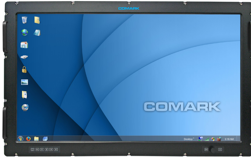
DS MDU42, Rev A